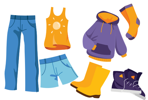
Warm clothing, regular clothes, old clothes that can be muddied up, runners (activities that would require running shoes), rubber boots.