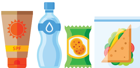
Sunscreen, water, snacks/food (especially during Sabbath afternoon activities) as needed.