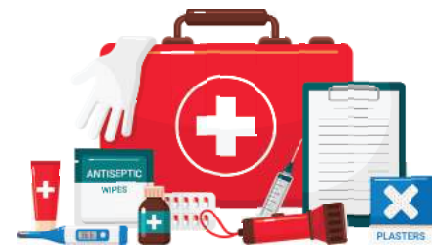
First Aid Kit for your own family. A team of nurses will be available to attend any medical emergencies.