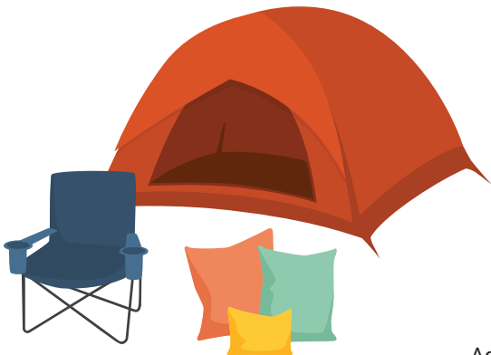
Bedding and pillows, tents and chairs if applicable.