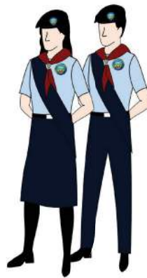
Adventurer and Staff are expected to wear "Type A" Uniform for Sabbath morning and "Type B with Adventurer Scarf" for Sabbath afternoon activities.